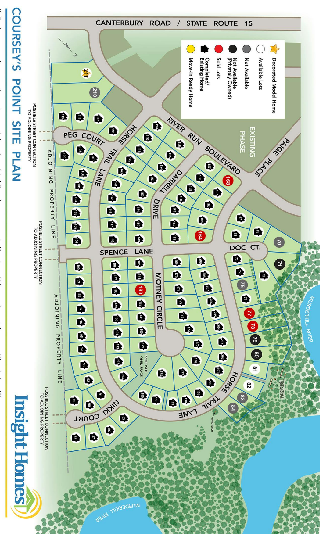
All site plans, community maps and computer generated or enhanced depictions shown are conceptual in nature, which may not accurately represent the actual condition of the item(s) being represented and are subject to change without notice. All buying decisions should be based on visiting and viewing the physical homesite.