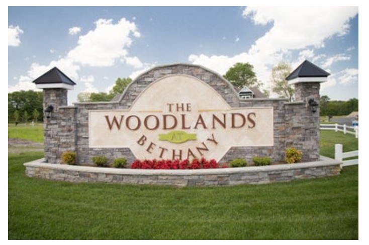
Visit our model home and learn more about finding your new home in this Frankford community.

From Route 1/Coastal Highway: Head south and turn right onto Route 26 (Bethany Beach). Proceed to Kent Avenue (first traffic light) and turn left. Turn left at Double Bridges Road, just over the canal bridge. The community is approximately 2 miles on the right.